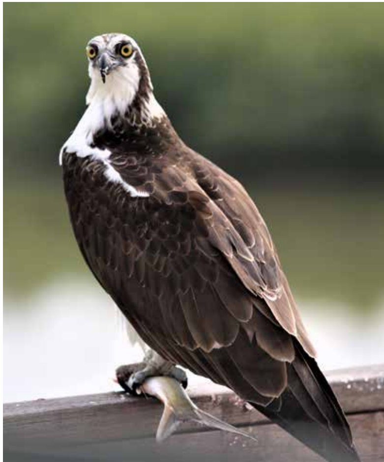
This osprey on Sanibel Island rests before eating the fish it just caught.